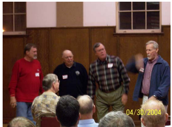
Ham N' wry quartet entertaining the audience