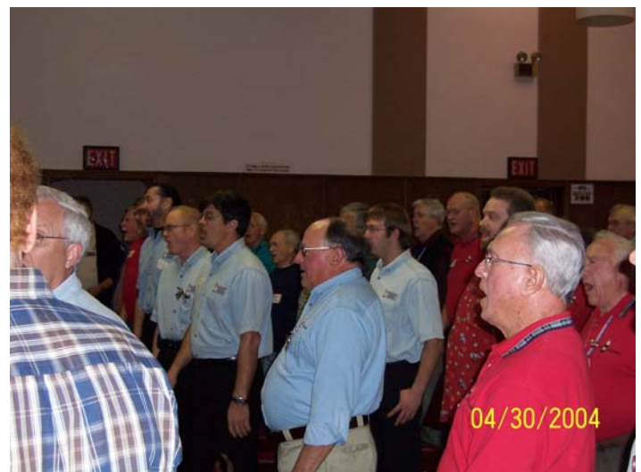
Enjoying an evening with song and good fellowship